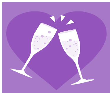
Chalet Party Shoppe has a variety of champagnes sparkling wines to toast the happy couple!